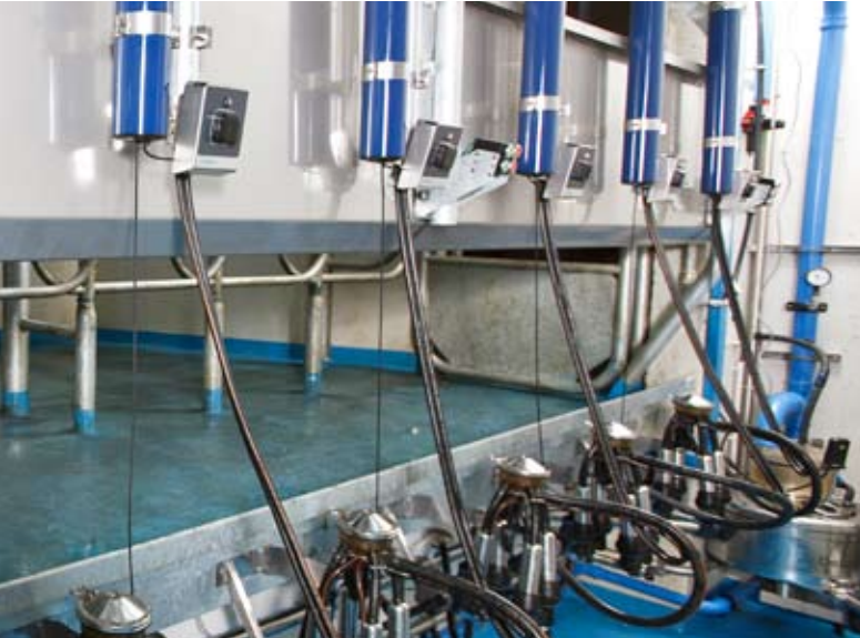
DeLaval MPC150 in parallel parlour P2100