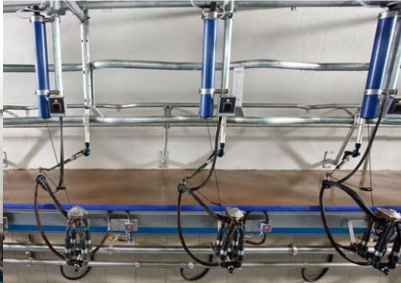
DeLaval MPC150 in herringbone parlour HB30